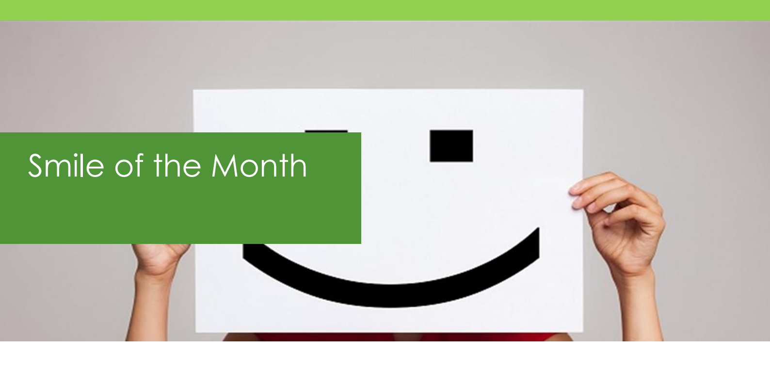
Brightside Smile of the Month – February 2022 BEFORE AFTER