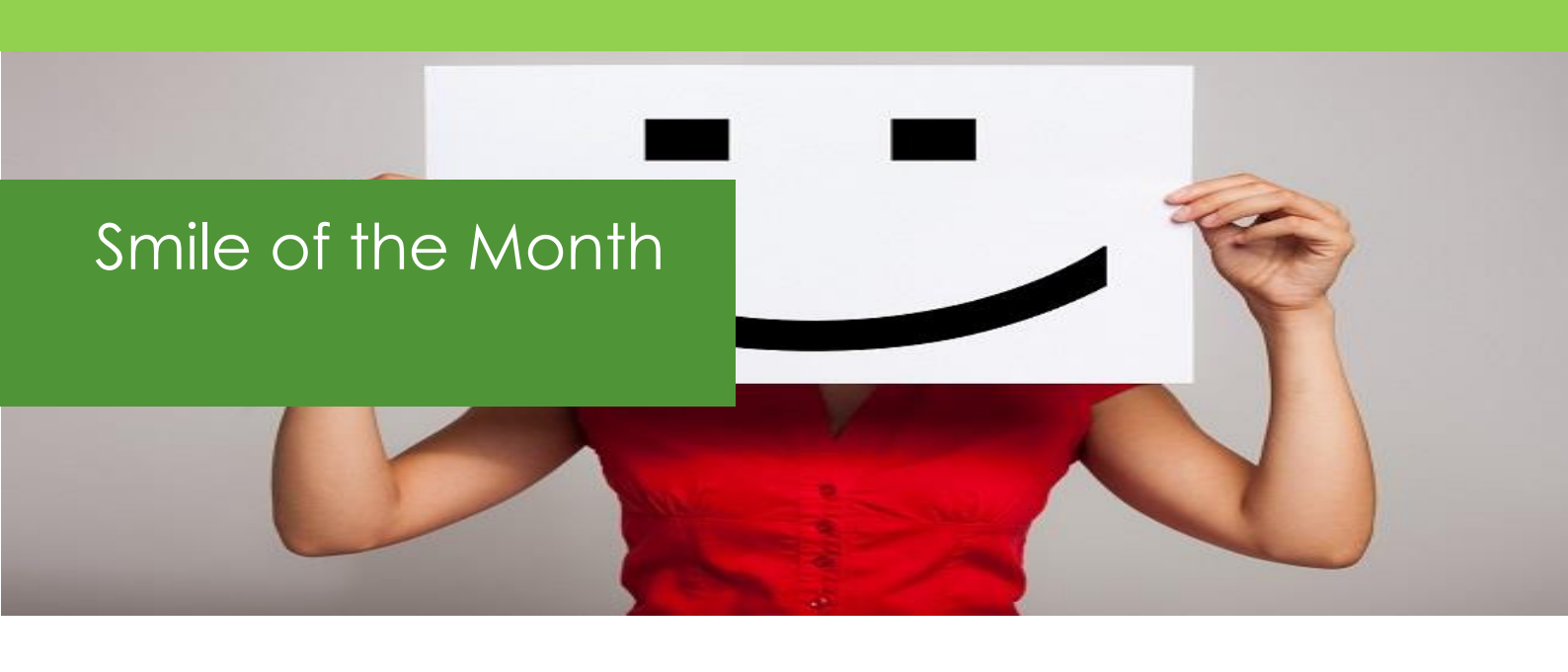
Brightside Smile of the Month – June 2022